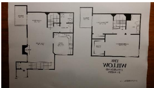
Actual Layout of 7352 Elm Court. it is a mirror image of another Willow Model layout